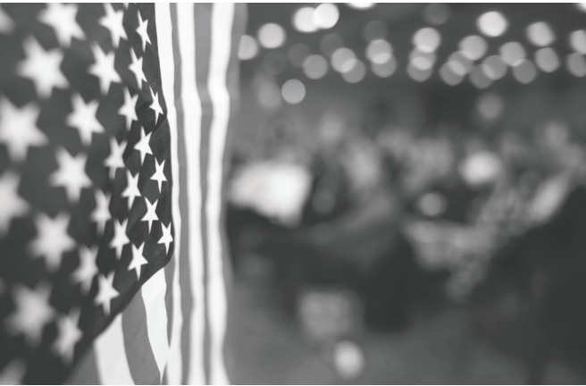
Americas Travel Show 2024.