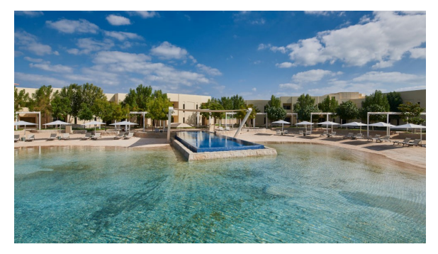
Zulal Wellness Resort by Chiva-Som

<u>The Ritz-Carlton</u>, features a signature spa that redefines luxury and pays homage to traditional Qatari heritage. Experience total serenity with a unique blend of Arabic principles, Asian traditions and European concepts. Try one of the the "Desert Cooler", with cooling aromatherapy blends that will rejuvenate you from the heat of the desert.